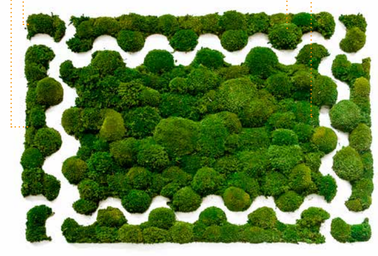
Greenhill Puzzle, colour: moss green – individual pieces