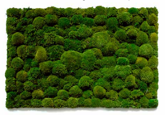
Greenhill Puzzle, colour: moss green – assembled